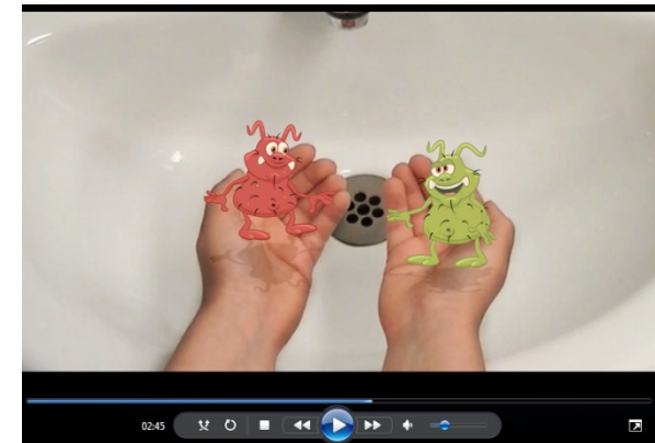
“How-to Wash – Outsmart Germs”