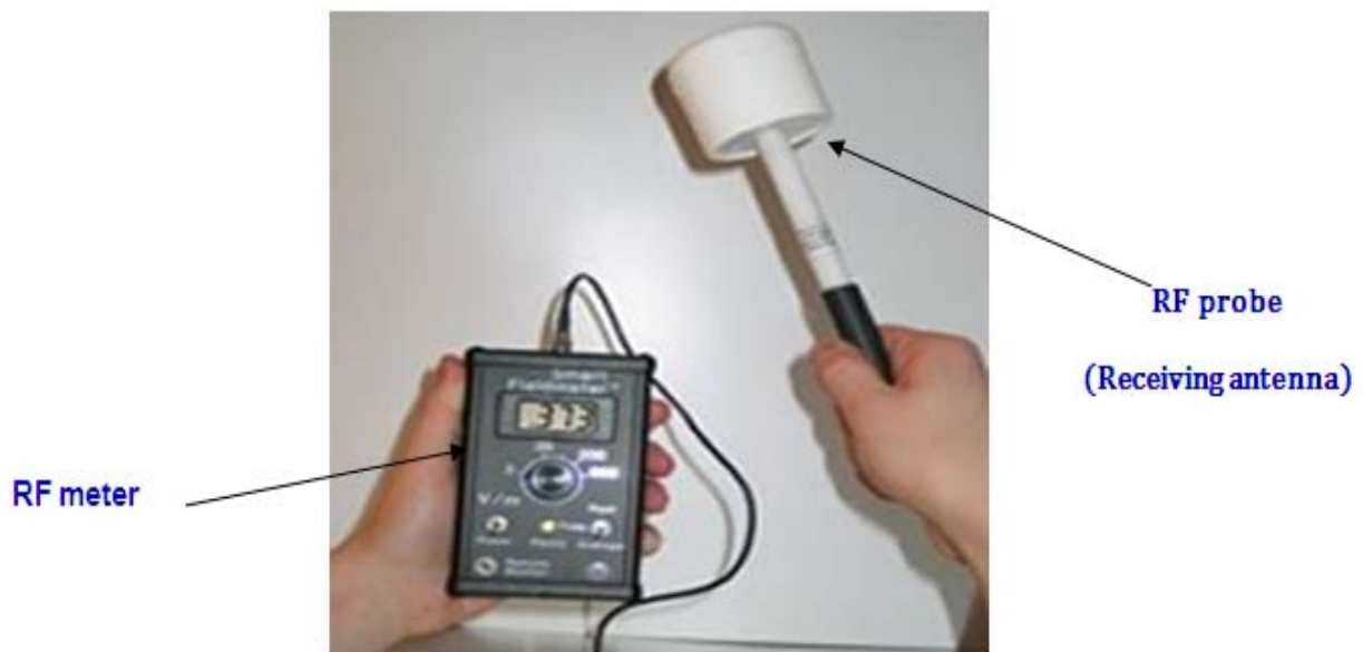
Figure 4.2 Portable RF survey meter

A standard RF survey meter is basically a combination of a receiving antenna (probe) and a meter.