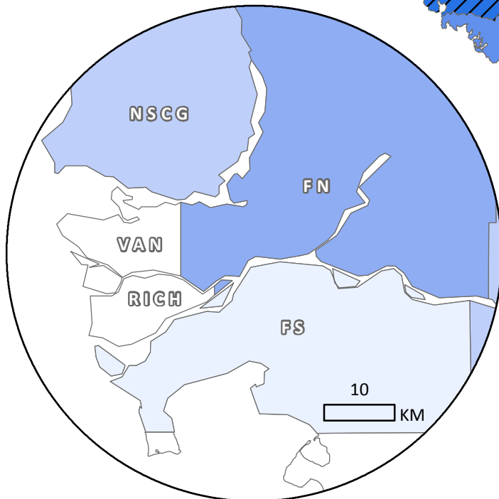
Lower Mainland inset

BC Centre for Disease Control AN AGENCY OF THE PROVINCIAL HEALTH SERVICES AUTHORITY