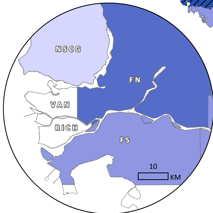
Lower Mainland inset

BC Centre for Disease Control AN AGENCY OF THE PROVINCIAL HEALTH SERVICES AUTHORITY