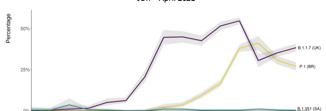
Figure 2. Estimated prevalence ^{\Delta} of VOCs by lineage and by epi week of collection date, Jan – April 2021

The main circulating variants are B.1.1.7 and P.1, with B.1.1.7 accounting for ^{60} % and P.1 ^{40} % of the three main VOCs (Figure 2). Please note that the estimate of distribution of VOC lineages in BC for latest epi week (15, April 11-17) may change as more sequencing results are analyzed.